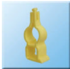
AV-001 Hanger Bracket 5 pieces per section of 3,05 m