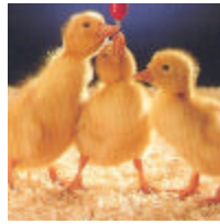
MK-035 Broiler Nipple 3,0 mm pin - 65 ml/minute