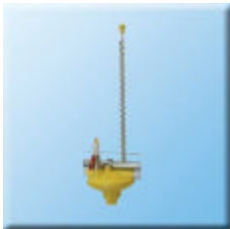
VR-202 End or Midhouse pressure regulator assembly