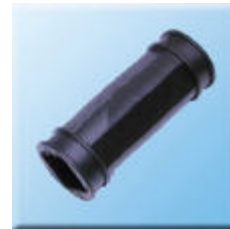
GL-507 Bellow Joint soft connector for square pipe