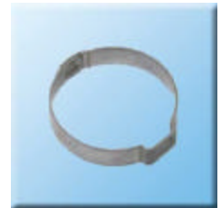
OE-316 Ear Clamp 2 pieces per bellow joint