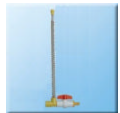
VE-323 End Assembly with drain ball valve and hose connector