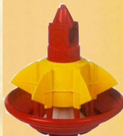
Cockerel Male Feeder with pipe fixing clamps