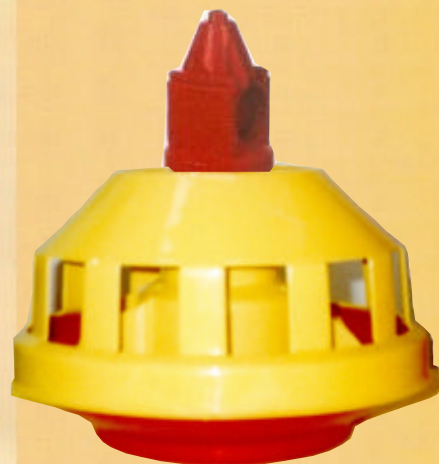
BreedFlex Female Feeder with male exclusion grill

Europ Patents N-MI-99-A-002237 & N-MI-97-A-00008